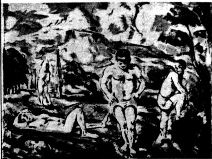
Cézanne, Les Baigneurs (grande planche), color lithograph, third state, circa 1897.

Mon Nov 5 Old Master through Contemporary Prints 10:30am & 2:30pm Inquiries: Todd Weyman Illustrated Catalogue: $35 in U.S./$45 Elsewhere